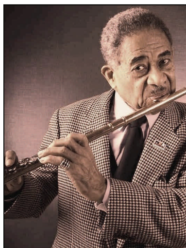
Just Jazz Artist of the Month saxophonist-flutist Frank Wess